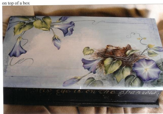
His Eye is on the Sparrow Friday, Aug. 5 th