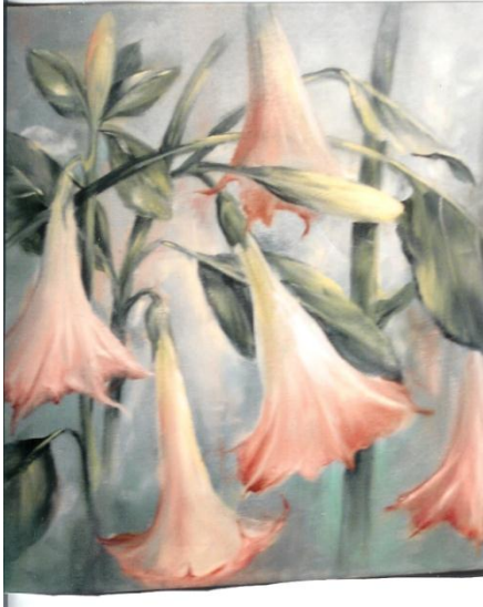
Angel Trumpet Thursday Aug. 4 th